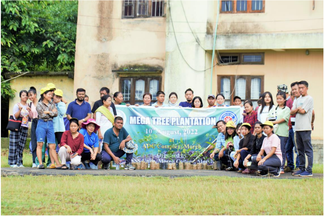
MEGA TREE PLANTATION AT ADC COMPLEX, MOREH