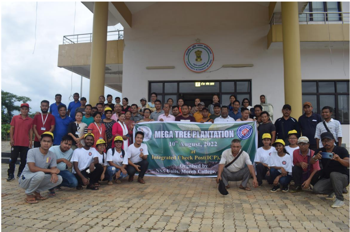
MEGA TREE PLANTATION AT INTEGRATED CHECK POST (ICP) MOREH