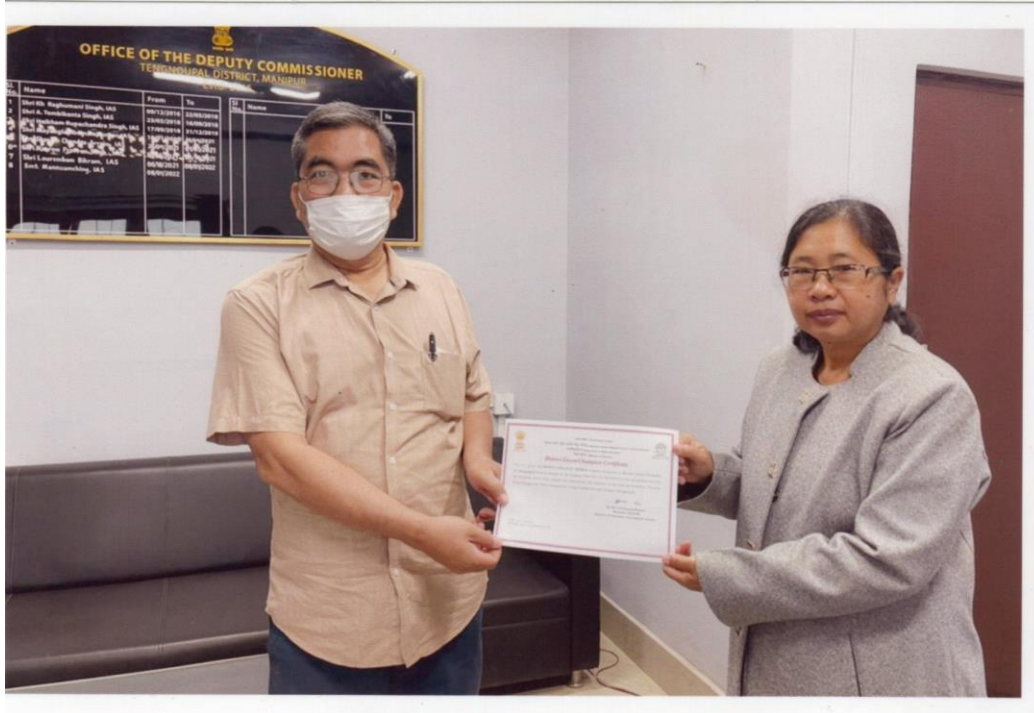
MGNCRE Award received from Deputy Commissioner, Tengenoupal