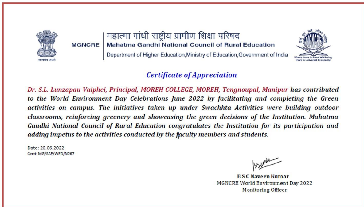
Certificate of Appreciation, Principal, Moreh College, Moreh